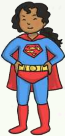
Full Stop Girl

I like to play football with my friends.