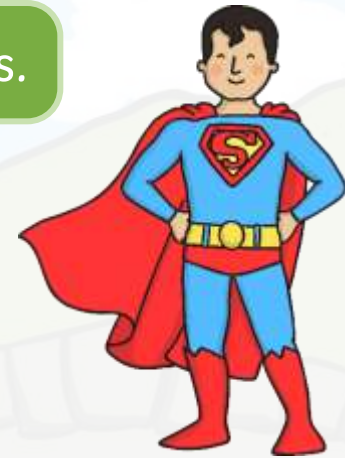
Captain Question Mark

I like to play football with my friends.