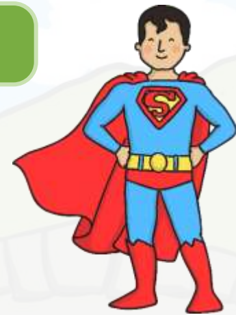
Captain Question Mark