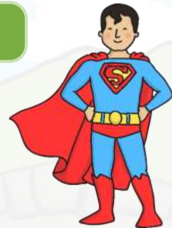
Captain Question Mark