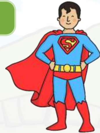
Captain Question Mark