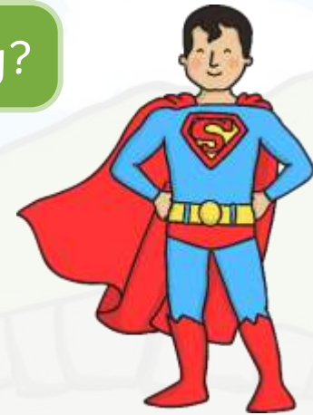
Captain Question Mark