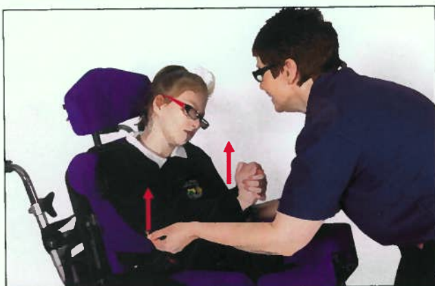
Elbows cupped in adult's hands (sustain the touch for two seconds)

Repeat the actions at Step 1. Provide additional support as required to transfer the learner safely.