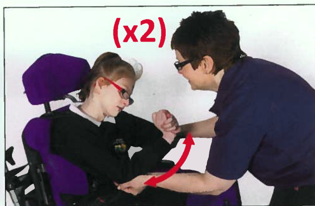
Gentle swaying motion