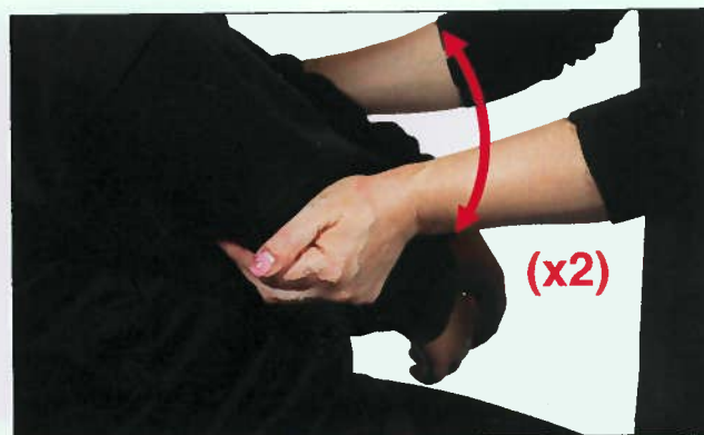
Gentle swaying motion