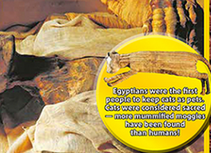
Egyptians were the first people to keep cats as pets. Cats were considered sacred — more mummified moggles have been found than humans!

The complicated mummification process shows that Egyptians had a good knowledge of the human body.