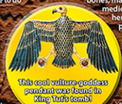
This cool vulture goddess pendant was found in King Tut's tomb!

In the months when the river was flooded, farmers were made to do national service — working to build pyramids, tombs and monuments for the pharaohs. World-famous places like Giza (right) were once huge construction sites, cities of 20,000 labourers working to build the giant tombs. The workers were fed, clothed, housed and given medical care, so they weren't exactly slaves, as once was thought.