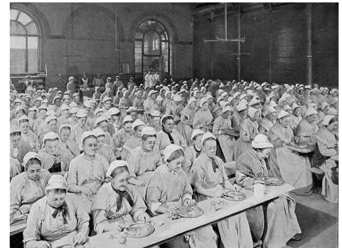
Women's mealtime at St Pancras Workhouse 1897

hospitals or wards of larger institutions. Some workhouses functioned as care and residential homes for a number of years. The days of the workhouse and the stigma and punishment that went along with being poor were over.