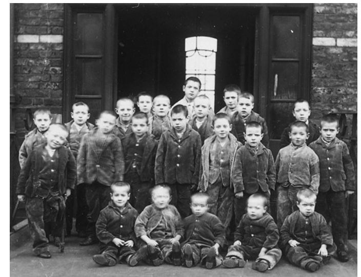
Children at Crumpsall Workhouse circa 1895

Picking oakum entailed taking lengths of old, tarred rope and unpicking the pieces. It was hard on the fingers and often performed by women or child inmates. In many workhouses, these tasks were to take place in silence.