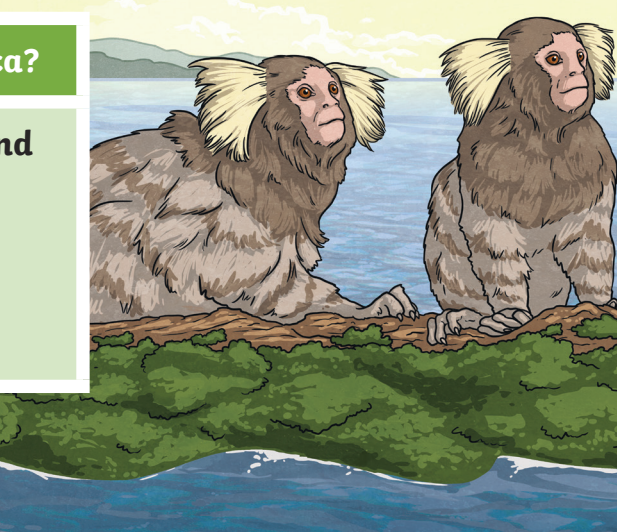
Illustration: Monkeys could have sailed on rafts.

The journey across the Atlantic would have been perilous and long. However, it would be a much longer crossing if any monkeys were