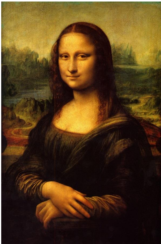
Mona Lisa – 1503 – 1506

By either using any books you have or by looking online, research four different portrait artists. Look for portraits that you like and collect some images on a Google document. Look at my examples below. Find facts and figures, but also put your opinions in.