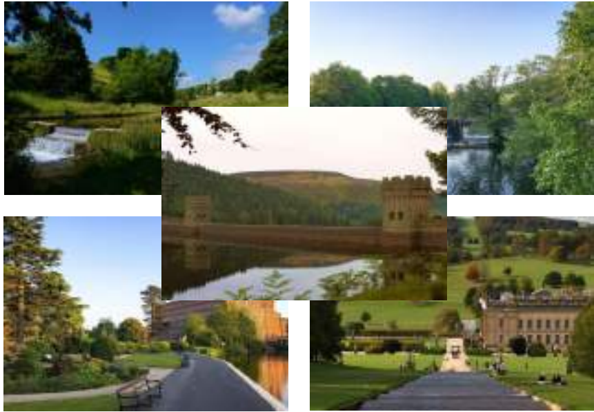
The Peak District, England