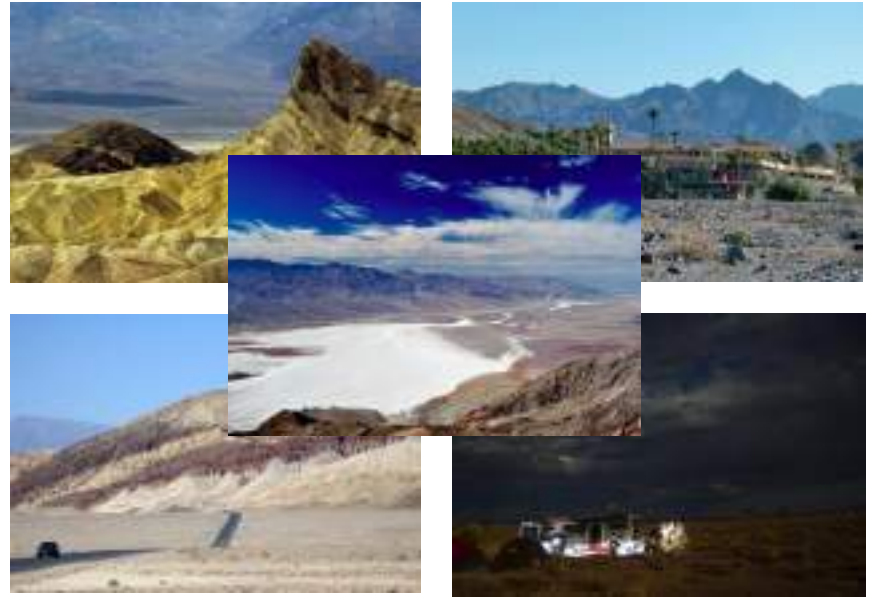
The Death Valley, California, USA