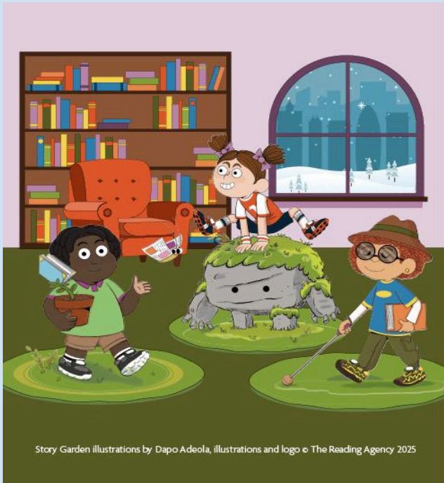
Story Garden illustrations by Dapo Adeola, illustrations and logo © The Reading Agency 2025

THE READING AGENCY Winter Mini Challenge